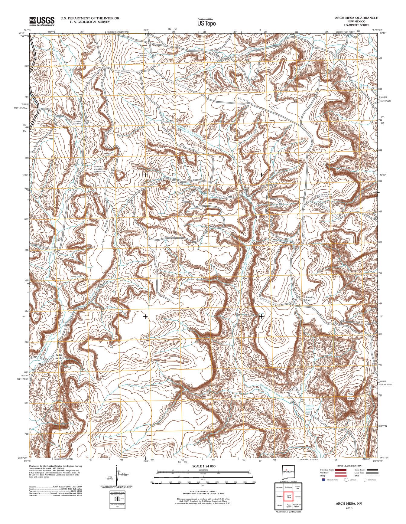
Figure 3. Browse image of a US Topo GeoPDF. Orthoimage layer off.