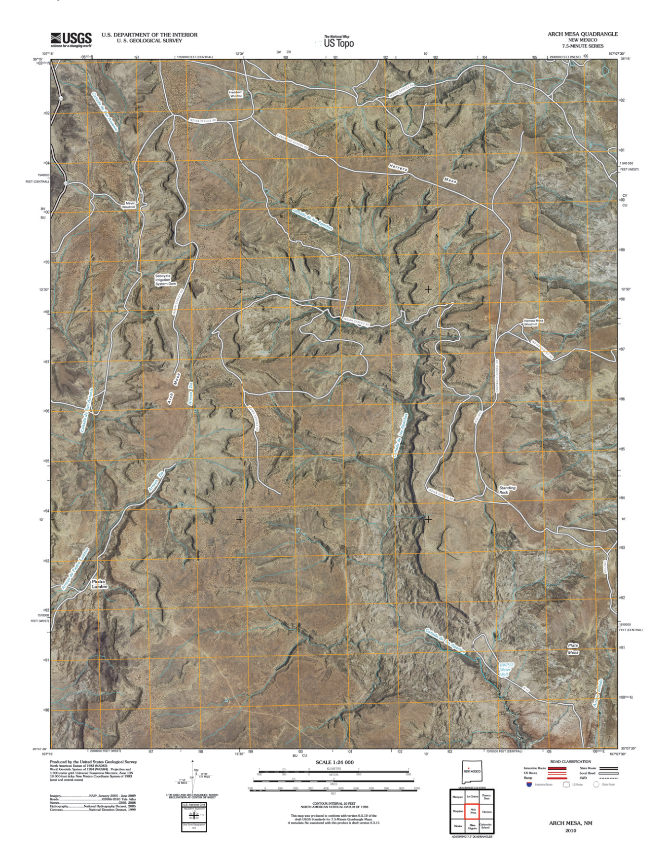
Figure 2. Browse image of a US Topo GeoPDF. Contour layer off.