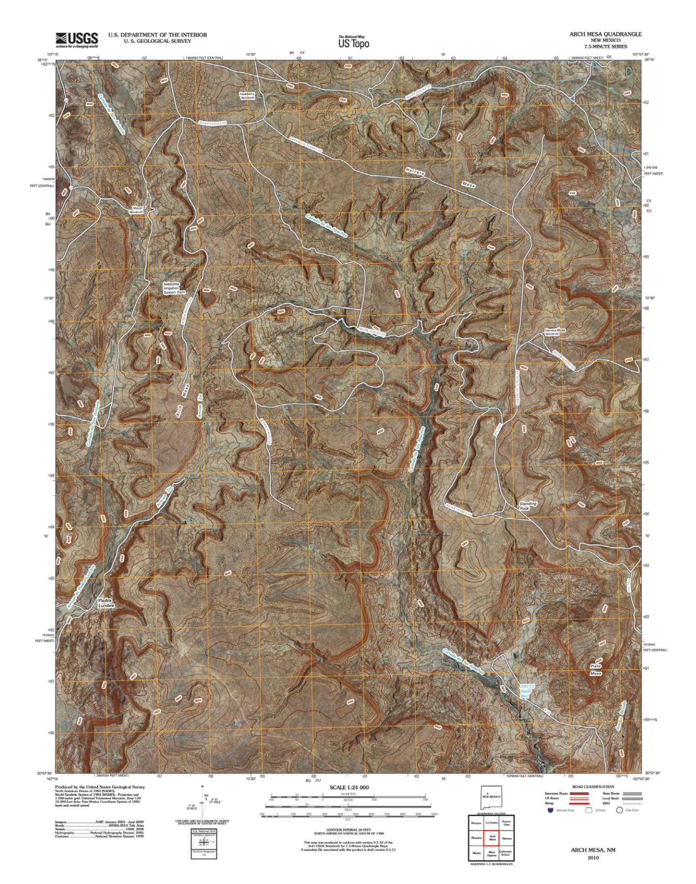
Figure 1. Browse Image of a US Topo GeoPDF. All layers on.